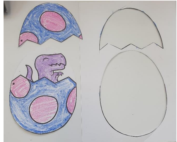
2. Cut both sides out. Make sure to cut on the grey line, NOT around the animal