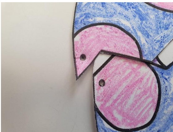
3. Put holes through the black dots